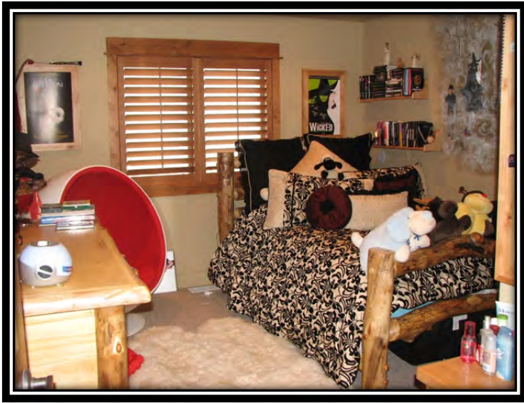
4 th Bedroom