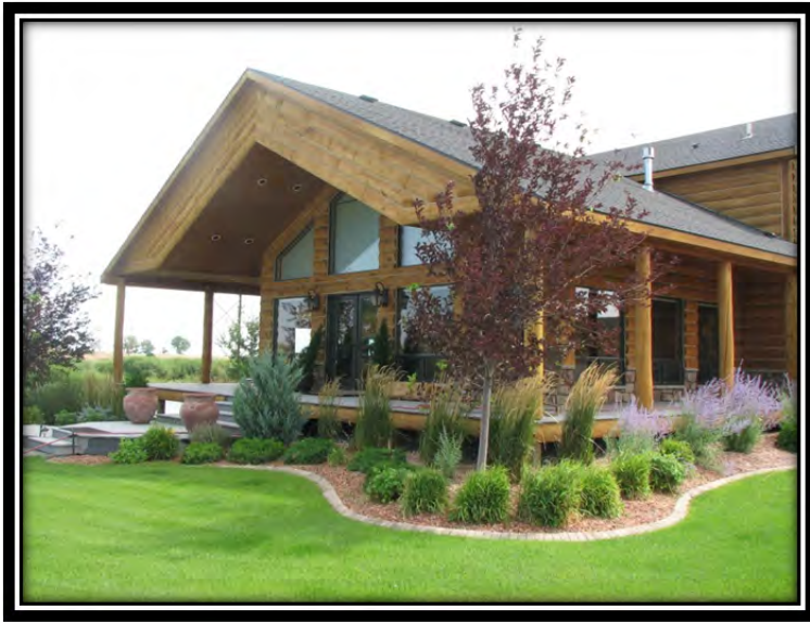
Whispering Winds Ranch