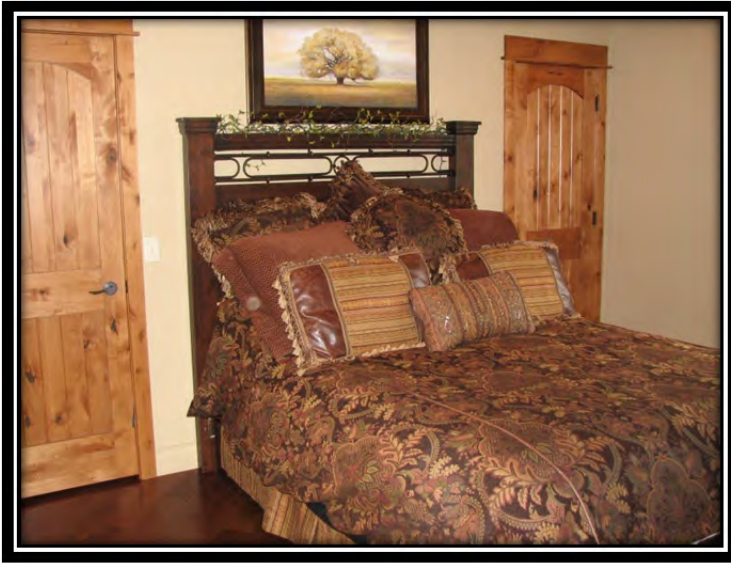
Master Bed & Bath