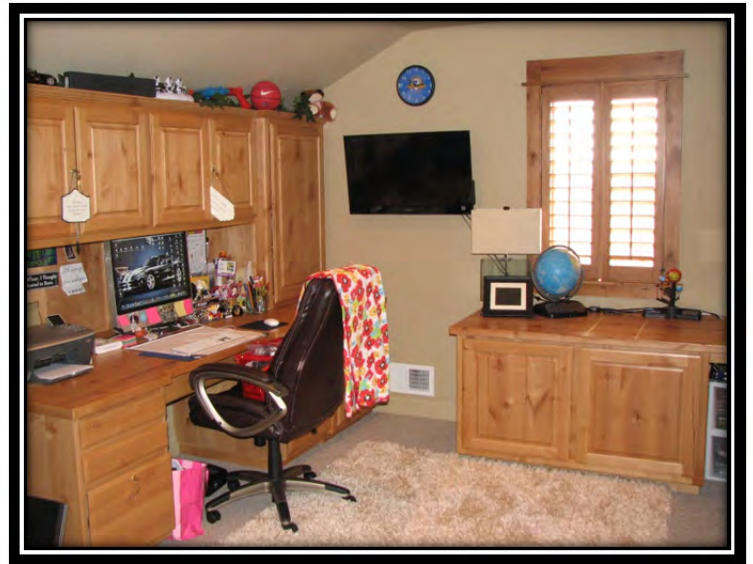
Office 2 nd Floor or 5 th Bedroom