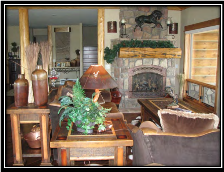
Fireplace in Great Room