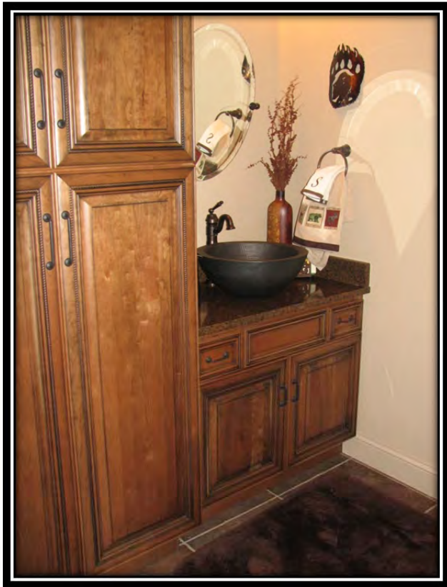
Guest Bathroom Main Floor