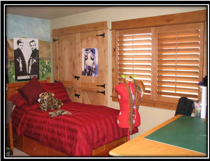
Bedrooms 2 & 3