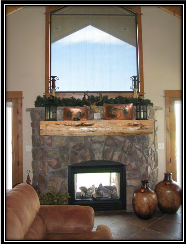
Fireplace in Family Room