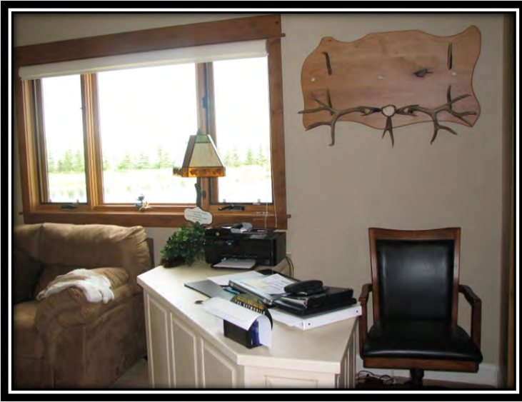
Office Main Floor